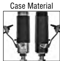
Aluminum Case Steel Case