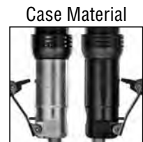
Aluminum Case Steel Case