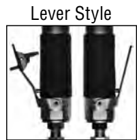
Safety Lever Standard Lever